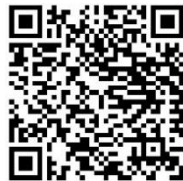
For the Pearl